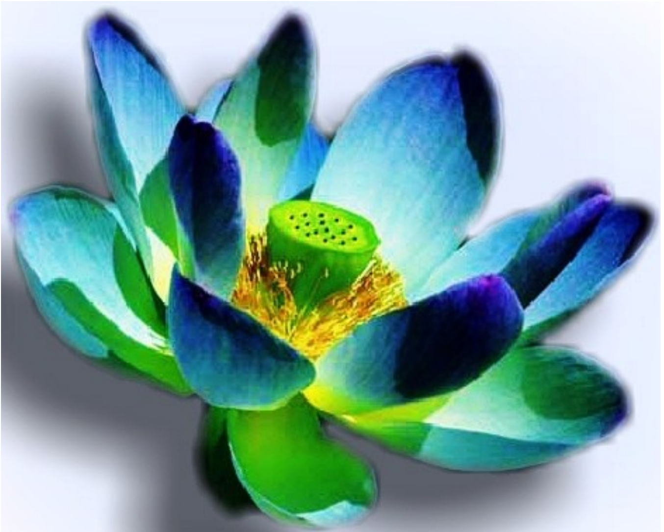
Nymphaea Caeruleus ( Blue Lotus )